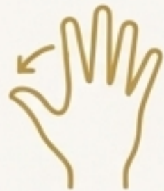
Flamenco & Fingerstyle