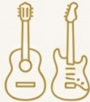
Classical & Electric

Building on a proven legacy, the vision has expanded. The Ultimate Guitar Cruise is the first event of its kind to unite the world of guitar in one extraordinary experience at sea.