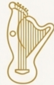
Harp Guitar & Microtonal